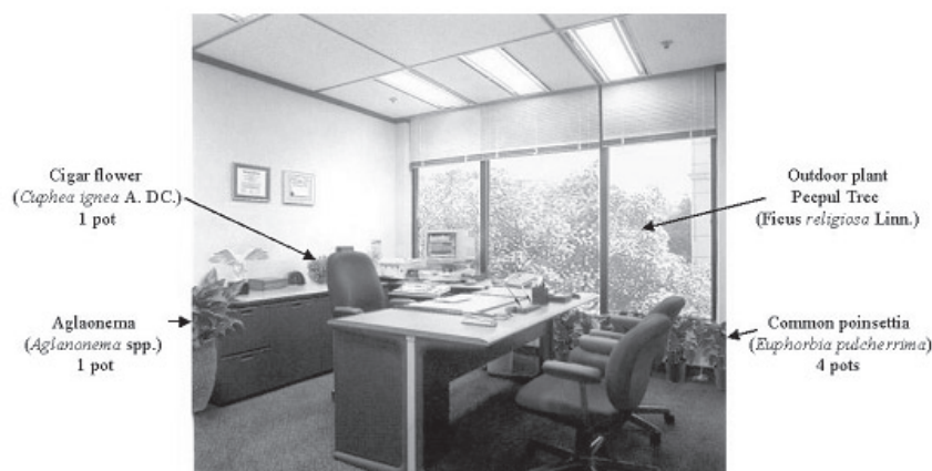
Fig. 1. (A) Workplace office environment with six difference window view and plant simulations that respondents viewed. (B) Arrangement of indoor and outdoor plants in simulated workplace.

consisted of students, studies have shown that students can represent the public on research involving visual stimuli (Kaplan & Herbert, 1987). Participants in this study were selected via a convenience sample. In total, 38 students participated in the study, including 10 males (26.4%) and 28 females (73.6%). All of the participants were in good health condition evaluated by asking the questioning items of “Twelve hours before this test, do you have more nicotine, alcohol than usual?”, “Twelve hours before this test, did you have any drugs?”, “One week before this test, did you have any sickness?”, “Do you feel uncomfortable during this test?”, and “Do you feel sleepy or unable to concentrate during this test?” at the time of laboratory testing, a necessary when monitoring physiological measures.